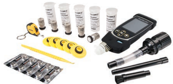
PosiTector CMM IS Pro Kit includes the PosiTector DPM Advanced

Replacement chambers, salt solutions, tools, caps, stackable probe extensions, and fins are available upon request