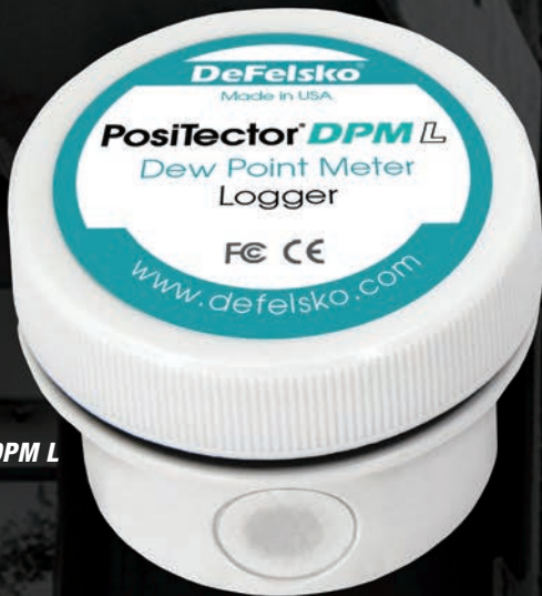
PosiTector DPM L