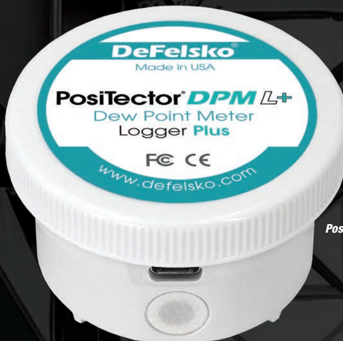
PosiTector DPM L+