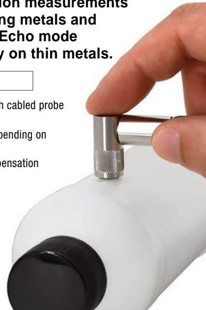
UTG P for high resolution and thin materials