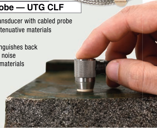
UTG CLF for cast materials