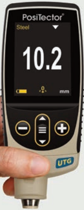
UTG CA for one-handed operation

Measures the wall thickness of materials such as steel, plastic, and more. Ideal for measuring the effects of corrosion or erosion on tanks, pipes, or any structure where access is limited to one side.